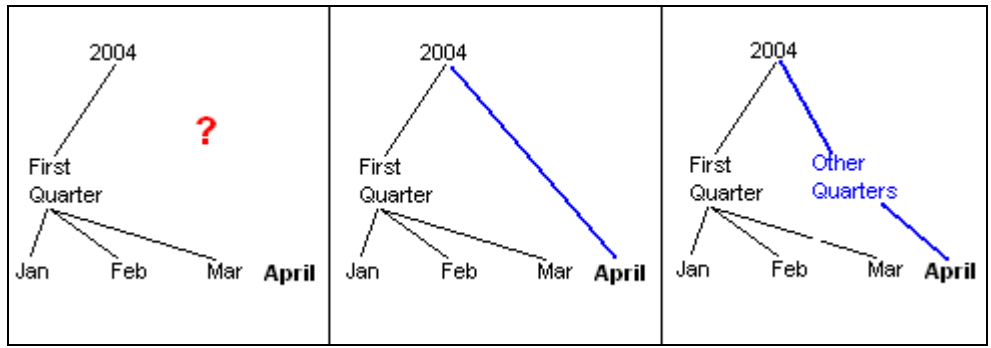
Figure 3 - Solutions for Unconnected Leaves

If a leaf doesn't have a father, i.e. isn't connected with a node at a superior level, which defines a coarser granularity to the facts, an intermediate member has to be created, or the leaf may be linked directly to the top of the tree – All Level.